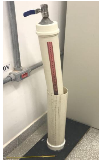
Figure 7.Record of the biodigester after 26 days of the first test.

This result reinforces the idea that the baronesa, together with cattle manure, is an excellent producer of biogas, with better results in the long term, and verified the difference of 5 days from the first registration (21 days in the first and 26 days in the second), practically doubled production. Figure 7 illustrates the recording of the second stage of the experiment.