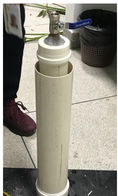
Figure 4.PVC biodigester used in the biogas production process.

To carry out the fermentation and to generate the biogas, the biodigestor was isolated, filling the outermost radius with water and then capping it with a holder having a check valve. The biodigester was kept hermetically sealed and allowed to stand at a temperature of approximately 32 °C for 55 days, being verified over time that in fact there was gas production, Figure 4 presents the biodigester.