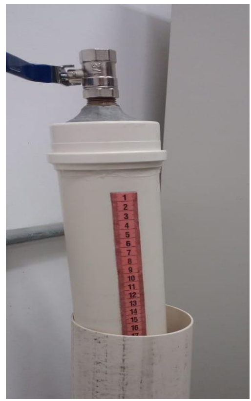
Figure 5.Gasification index in 3 weeks.

Soon after the experiment was carried out, the evolution of the gas production from the obtained mixture was checked periodically. Initially, the progress of biogas generation presented low gasification rates. However, over time, evolutions were noticed, revealing the efficiency of the biomass used as source. Figure 5 shows the gasification index in the first three weeks.