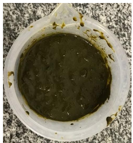
Figure 2. Mixture obtained from mashed Baronesa and bovine manure.

Subsequently, the materials were homogenized for 5 min. in the blender in order to increase the contact surface between the components contributing to the better efficiency in the biogas production, then the mixture was deposited in the becker (Figure 2).