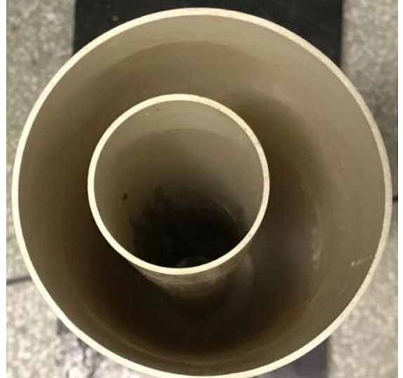
Figure 3. Pasty mixture inserted in the biodigester.

A mixture of pasty texture was obtained that was deposited in the batch-type biodigester handcrafted in PVC material with a maximum capacity of approximately 981,25 cm<sup>3</sup> of organic matter, in this type of biodigester the organic material is introduced at once(Figure 3).