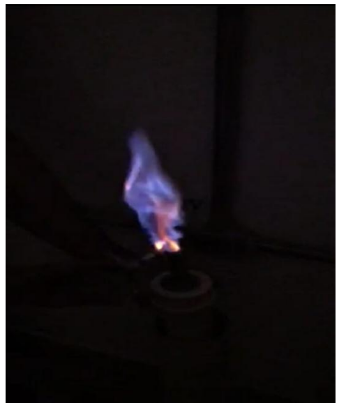
Figure 6. Flame test in the biodigester.

A displacement of the 17 cm biodigestor column was verified, evidencing the biogas production. Afterwards, the flame test was carried out, which consists of the burning of the biogas produced through the release by the valve present in the biodigester. If the flame obtained remains in its natural color, the result of the production will be carbon dioxide (CO2). However, if the flame color change to blue, the biogas obtained produce methane, which resulted in the test being carried out. Figure 6 shows the result obtained for the flame test.